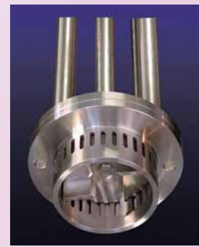
Figure 1 – Rotor/stator assembly of a batch high shear mixer.

A batch rotor/stator mixer is sized according to the volume of the mix vessel to ensure adequate flow. It can be used