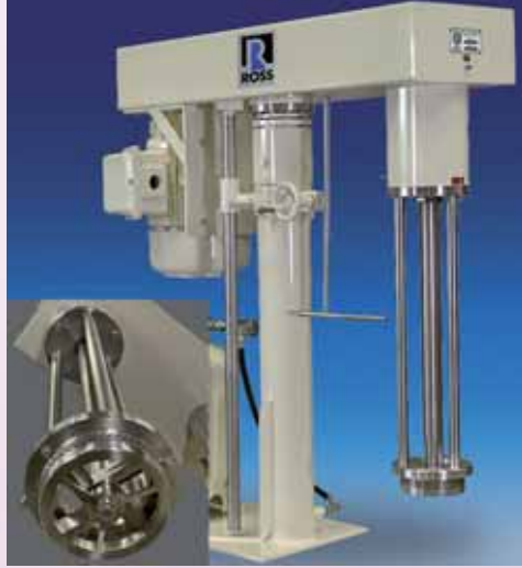
Figure 3 – PreMax Batch Ultra-High Shear Mixer with "Delta" rotor/stator (US Patent No.6,000,840) capable of tip speeds up to 5000 ft/min (1524 m/min).

equipped with a patented "Delta" rotor/stator assembly (Figure 3). The rotor is specially contoured for high pumping capacity and shear intensity. Product is drawn from above and below the mix chamber and expelled radially through the stator slots at high velocity. This generates upper and lower vortexes allowing for extremely efficient powder additions and rapid turnover rates. Very fine droplet sizes are achieved while solids are quickly wetted out instead of floating